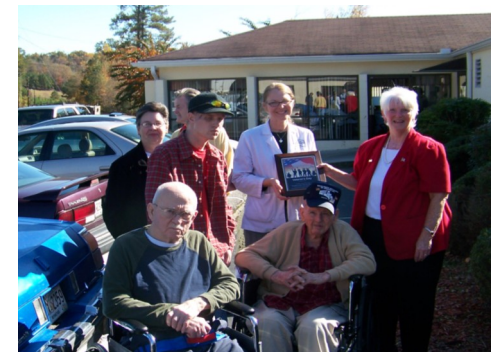
Veteran's Day: Members of the James Stewart Chapter NSDAR presented a flag to the Heritage Healthcare Facility in honor of the veterans residing there.

Our chapter daughters are proud of our heritage and work to support the National and State Societies' projects while preserving our local heritage. Come to one of our meetings to learn more and find the project you want to help support!